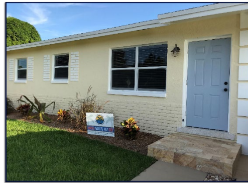
Hearts of Palm House Riviera Beach