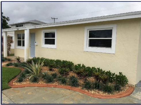
Hearts of Palm House West Palm Beach