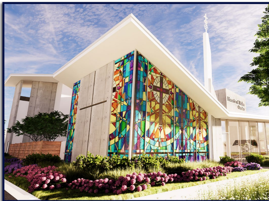
A Gift of Public Art to The Spirit of Community.

Phase II – Will begin following construction of Hearts of Palm Center. The Aquaponics Building will be built adjacent to the Hearts of Palm Center, The Aquaponics Garden.