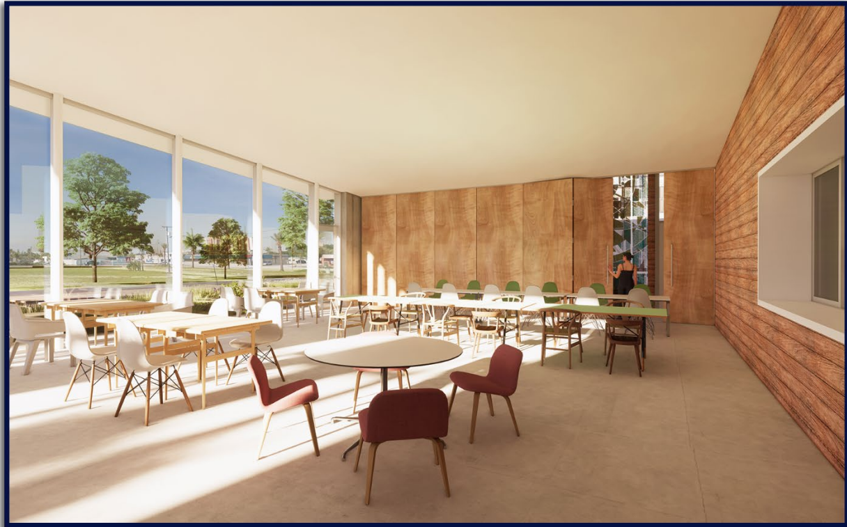
Conceptual Design of the Multi-Purpose Gathering Space